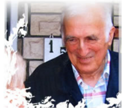
Jean Vanier, at L'Arche, Argentina

ENCUENTROS CADA PERSONA ES UNA HISTORIA SAGRADA